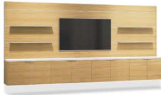
a.k.a. wall - suspended pedestal