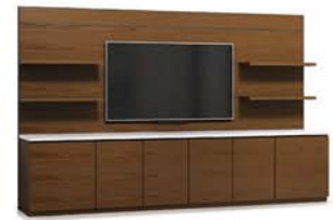
a.k.a. wall - standard pedestal