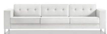
harmony - luxe