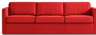
harmony - tuxedo