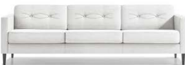
harmony - classic