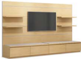
a.k.a. wall - low pedestal