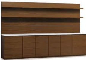
a.k.a. wall - serving pedestal

Conference Tables meet 2014 Bifma levels 7.6.1 & meets CARB P2 & TSCA Title VI in regards to Formaldehyde levels and the PVC content is less than 100 ppm by product weight.