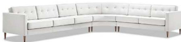
harmony - classic