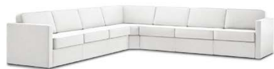
harmony - tuxedo