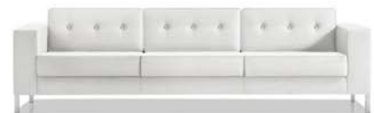
harmony - luxe