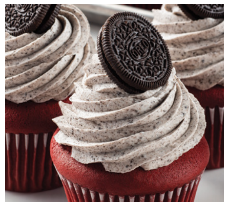
Red Velvet Cookies 'n Creme