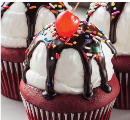
Red Velvet Sundae