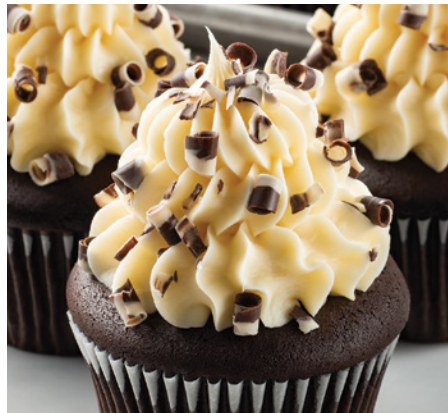
Dark Chocolate Cheesecake