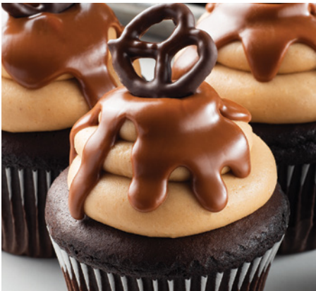
Chocolate Peanut Butter Pretzel