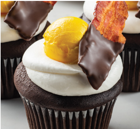
Eggs 'n Bacon