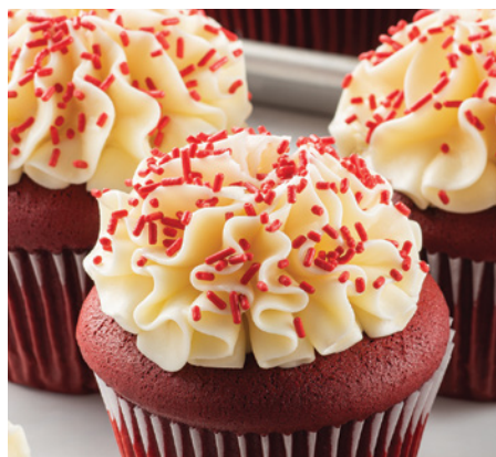
Classic Red Velvet