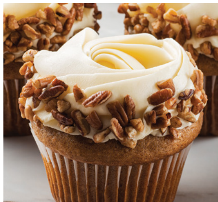
Traditional Carrot Cake