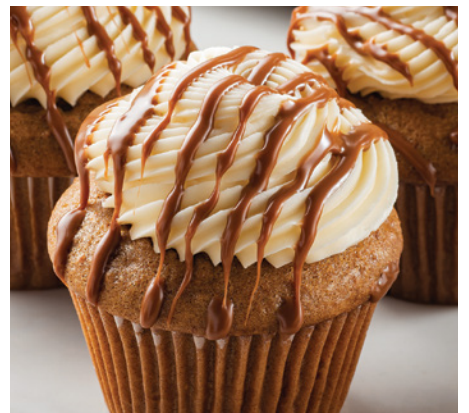
Salted Caramel Carrot Cake