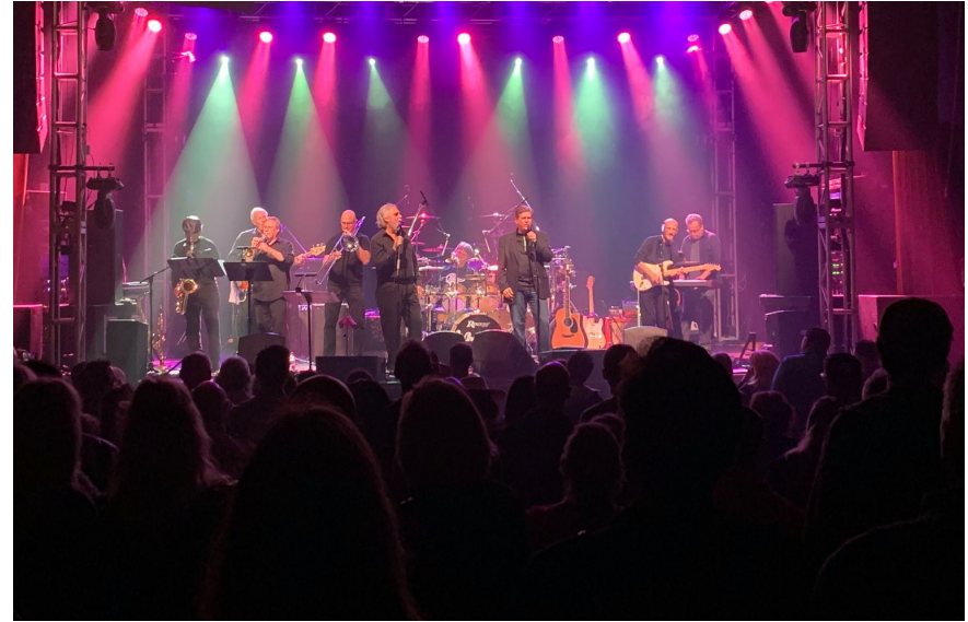
This is the band called Windy City.