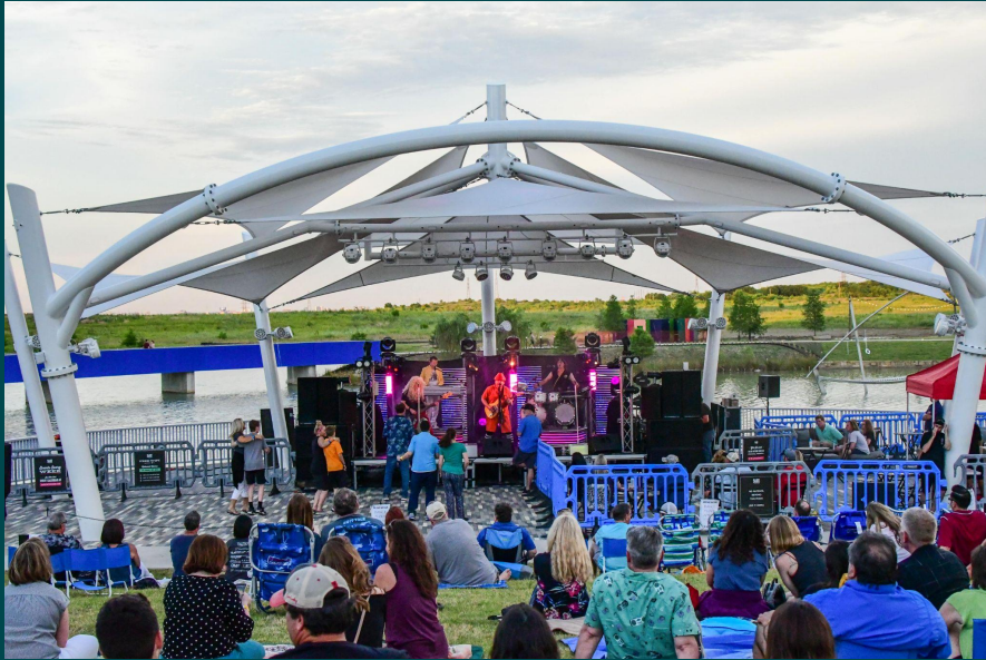
This is the concert stage.

At 7:30 pm there will be a band called “Windy City” playing songs on the stage! If it’s too loud I can wear headphones if I have some, or we can get earplugs from a restaurant or store to make the sound quieter.