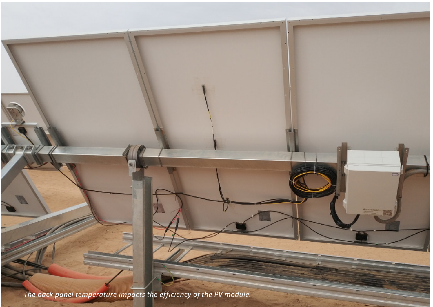
The back panel temperature impacts the efficiency of the PV module.

We can easily judge whether there is a problem of power station through calculating the capacity ratio between the actual and theoretical, that is Performance Ratio (PR). That ratio will become smaller as time goes on due to aging of technical components. We can observe the ratio change by a real-time data trend. Ideally, the PR presents a smooth line.