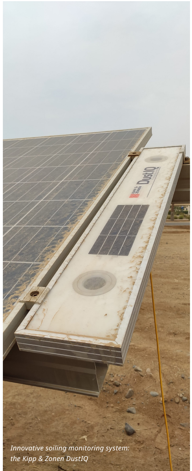
Innovative soiling monitoring system: the Kipp & Zonen DustIQ

We can calculate the threshold of dust index by analyzing the relationship between dust index and power generation. Below this threshold, the loss of power generation benefits equals the cleaning costs. Thus, we increase the intervals between cleaning procedures. Doing so, we can determine when to clean PV panels based on this threshold and find a balance between the generation benefits and cleaning costs.