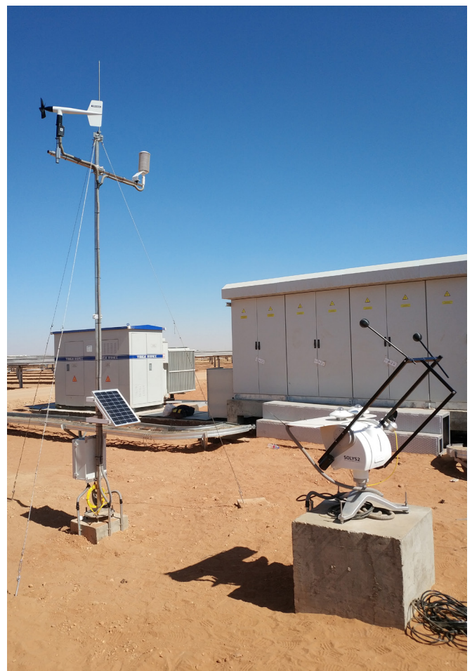
A Kipp & Zonen SOLYS2 sun tracker and a weather station.

To ensure the data authenticity of these small regional devices, we install two sets of more accurate measurement systems including sun trackers and weather stations in the central of each plant. The weather stations can measure atmospheric parameters as air temperature, wind speed and wind direction, and precipitation. This data serves as a benchmark to provide data support for O&M site staff to make decisions. For quick detection of problems, we set the frequency of data acquisition and calculation to 1 Hz – that is one signal per second.