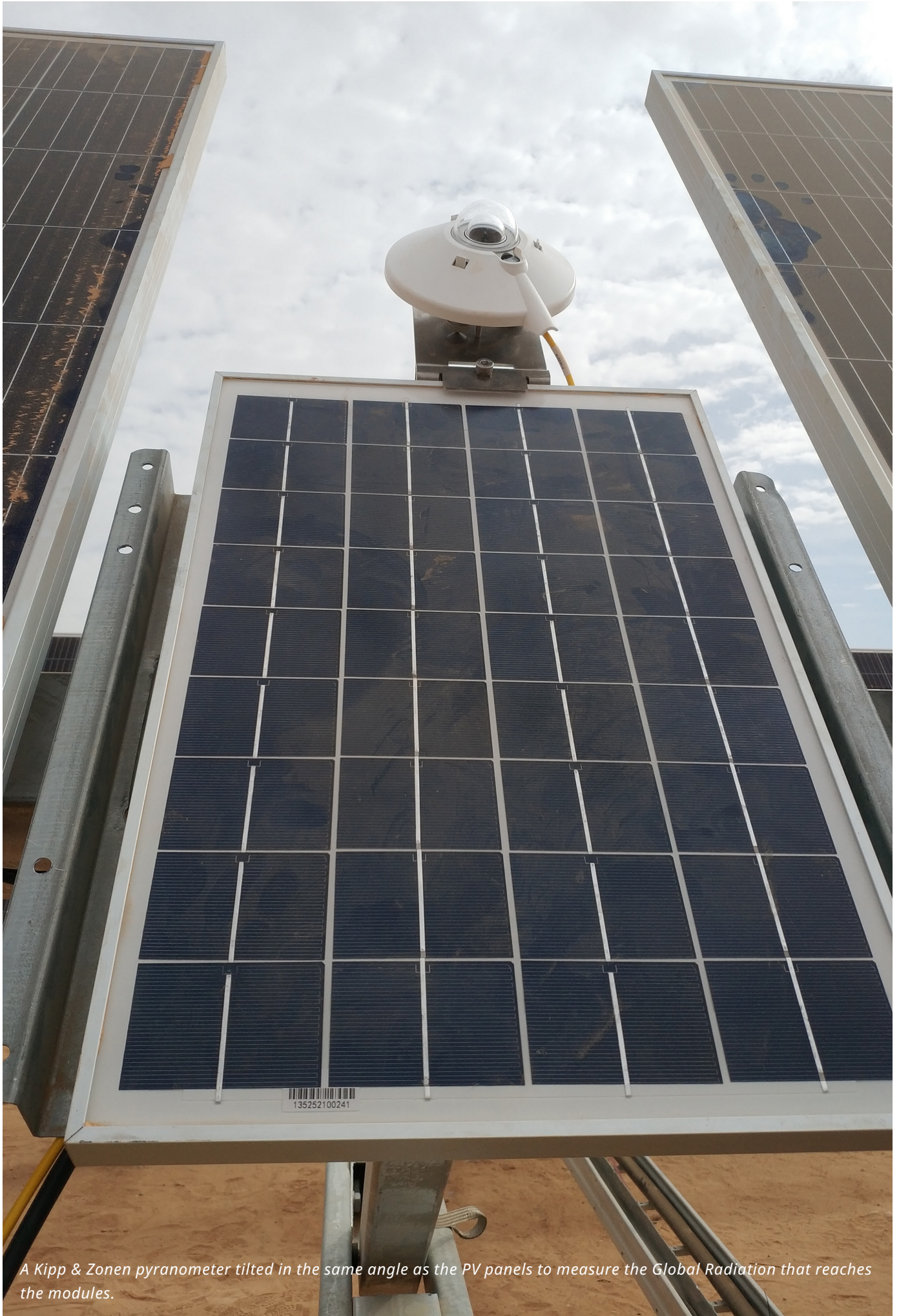
A Kipp & Zonen pyranometer tilted in the same angle as the PV panels to measure the Global Radiation that reaches the modules.