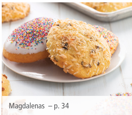
Magdalenas – p. 34