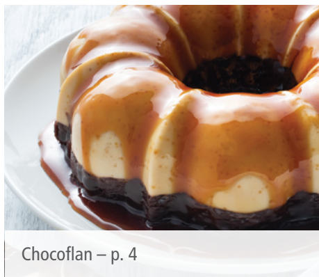
Chocoflan – p. 4