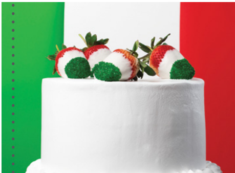
Tradicional Tres Leches Cake Mexicano – p. 14