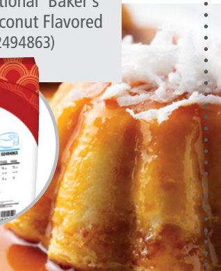
Cocoflan – p. 5

Dawn Exceptional® Baker's Request™ Coffee Flavored Cake Mix (02494201)