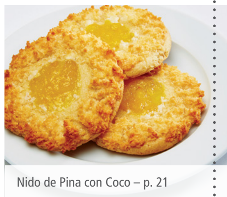
Nido de Pina con Coco – p. 21