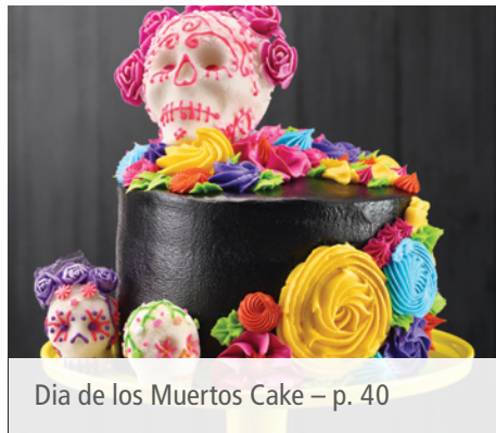
Día de los Muertos Cake – p. 40