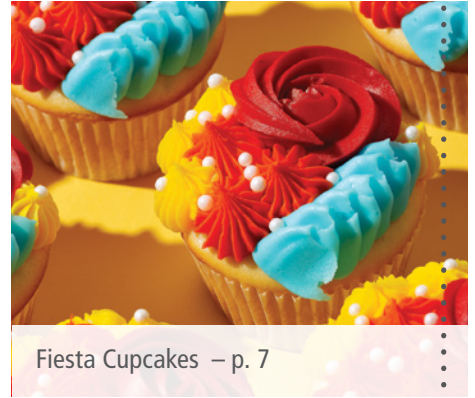
Fiesta Cupcakes – p. 7