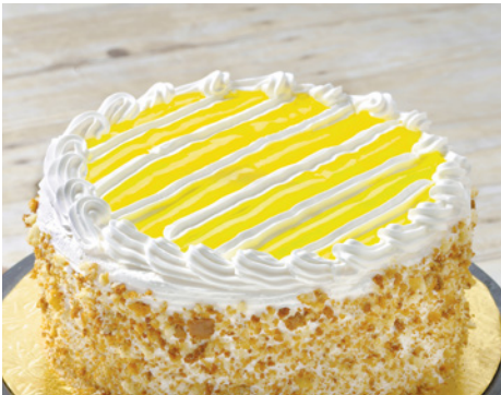
Pineapple Tres Leches – p. 17