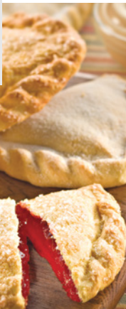
Empanadas – p. 29