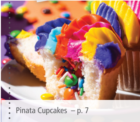
Pinata Cupcakes – p. 7