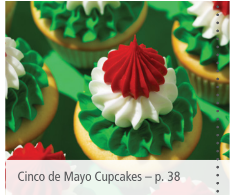
Cinco de Mayo Cupcakes – p. 38