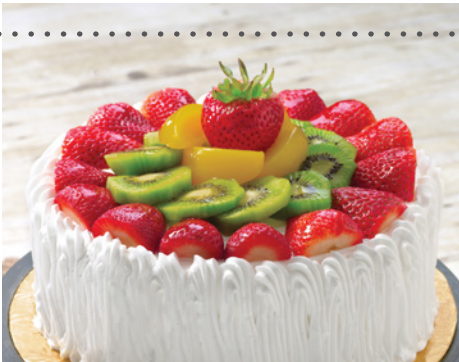
Tres Leches Cake – p. 11