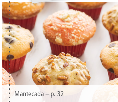
Mantecada – p. 32