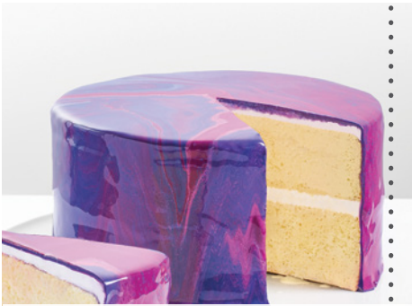
Tres Leches Cake with Mirror Glaze – p. 18