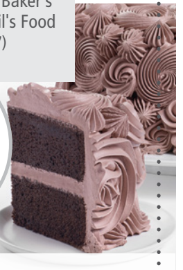
Whipped Creme Chocolate Cake – p. 10