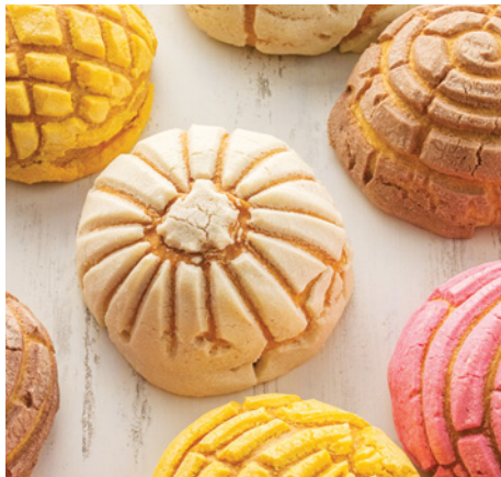
Conchas – p. 31