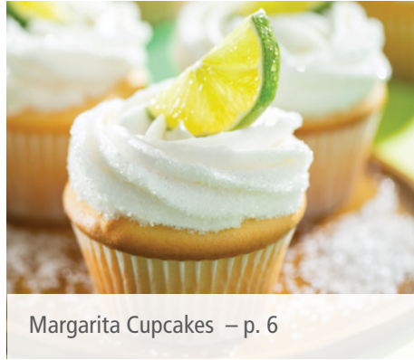
Margarita Cupcakes – p. 6