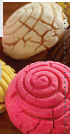
Conchas – p. 30

Dawn Exceptional® Jelly Roll Sponge Cake Mix (00006015)