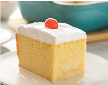
Tres Leches Sheet Cake – p. 15