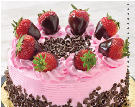
Strawberry Tres Leches Cake – p. 13