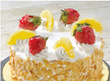
Strawberry & Pineapple Tres Leches Cake – p. 12