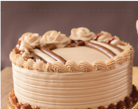
Dulce de Leche Tres Leches Cake – p. 11