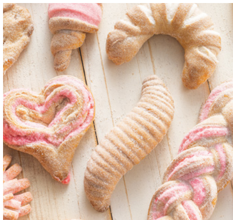
Pan Fino – p. 35