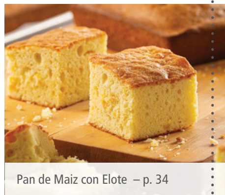
Pan de Maiz con Elote – p. 34

Dawn Exceptional® Baker's Request™ Yellow Cake Mix (00502551)