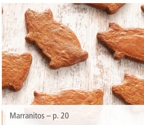
Marranitos – p. 20