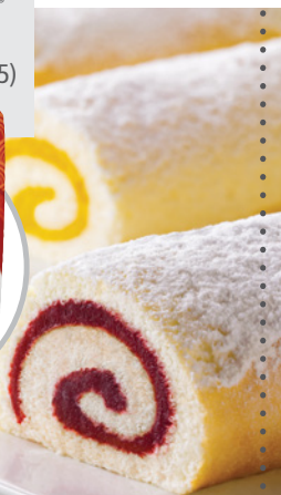
Brazo Gitano – p. 6