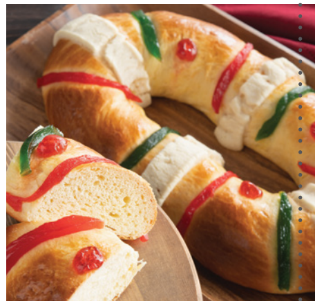
Rosca de Reyes – p. 43

Dawn Wholesale Sweetdough Mix (00731621)