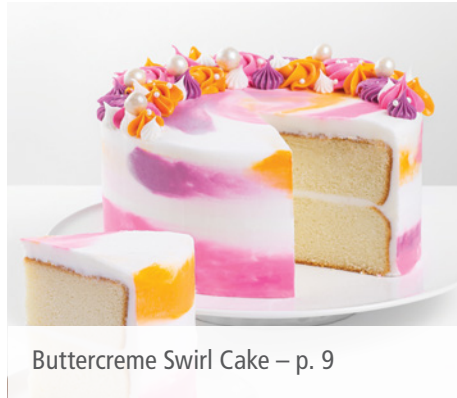
Buttercreme Swirl Cake – p. 9