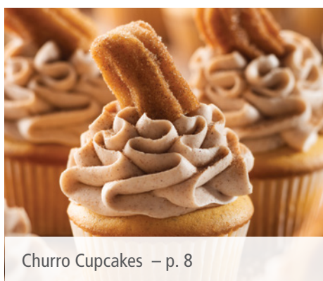
Churro Cupcakes – p. 8