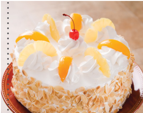
Mango Tres Leches – p. 17