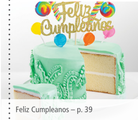
Feliz Cumpleaños – p. 39