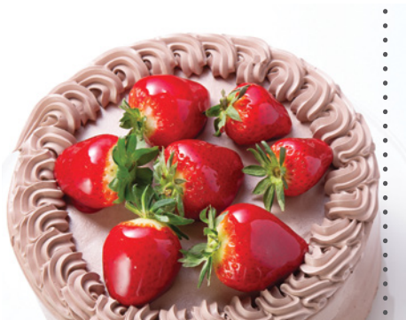
Chocolate Tres Leches – p. 15