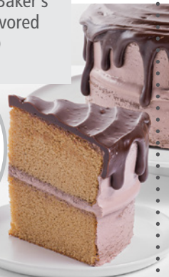
Mocha Cake – p. 9

Dawn Exceptional® Baker's Request™ Dark Devil's Food Cake Mix (00581167)