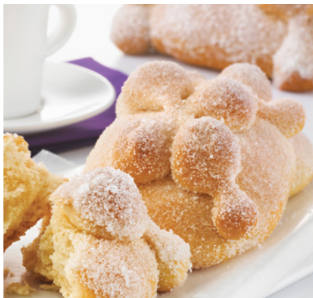
Pan de Muerto – p. 42