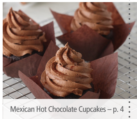
Mexican Hot Chocolate Cupcakes – p. 4

Dawn Exceptional® R&H® RichCreme® Vanilla Cake Base (00435926)