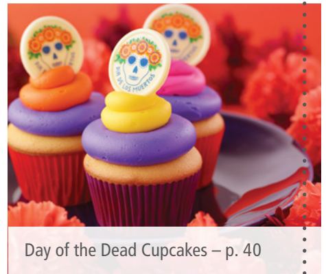
Day of the Dead Cupcakes – p. 40

Dawn Exceptional® Baker's Request™ Coconut Flavored Cake Mix (02494863)