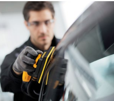
The compact Mirka® DEOS 383CV is ideal for body filler and primer sanding applications.