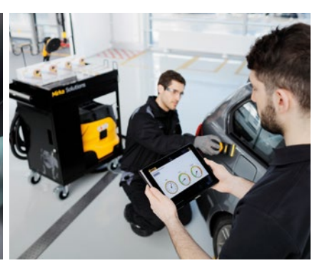
By using the myMirka <sup>®</sup> app you can monitor the vibration level when sanding with Mirka<sup>®</sup> DEOS.