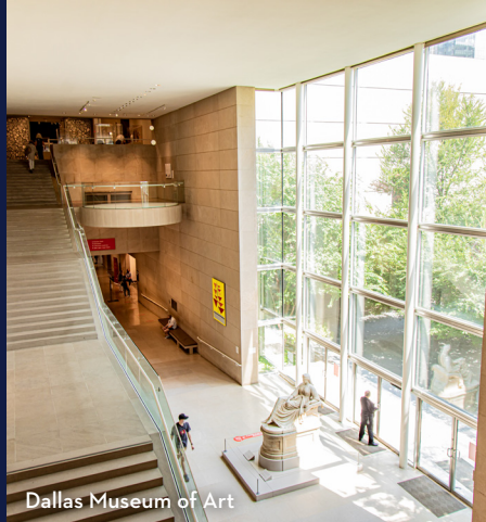
Dallas Museum of Art