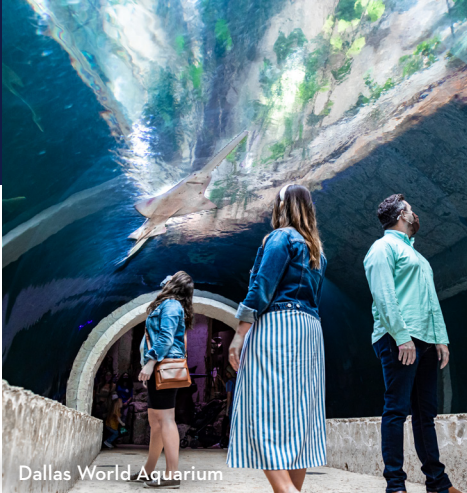
Dallas World Aquarium