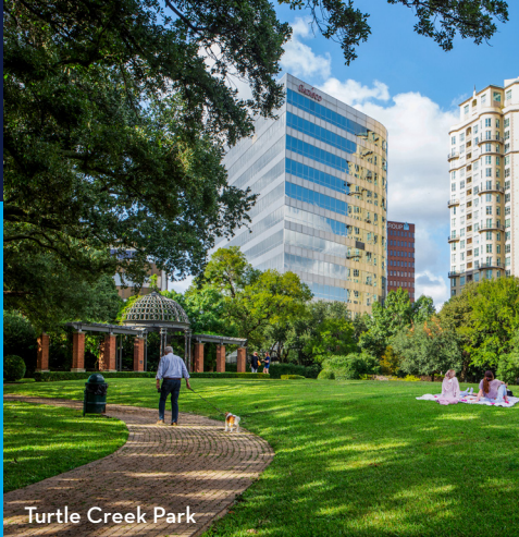
Turtle Creek Park

Wow your attendees with a venue that will surprise and delight. From ballroom spaces to unique museums that offer only-in-Dallas moments, any of these venues will make your next event a success.