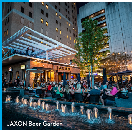
JAXON Beer Garden