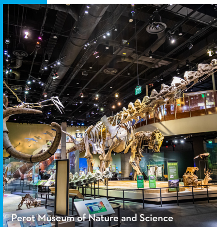
Perot Museum of Nature and Science