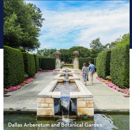
Dallas Arboretum and Botanical Garden