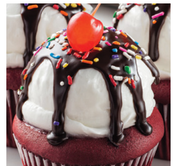
Red Velvet Sundae