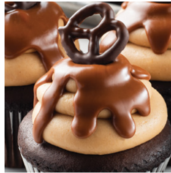
Chocolate Peanut Butter Pretzel