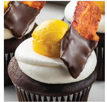
Eggs 'n Bacon