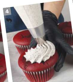
Pipe prepared buttercream on top of the cupcakes.