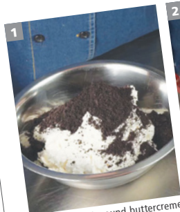
Mix together 1 pound buttercream and 1.5 ounces chocolate sandwich cookie crumbs.