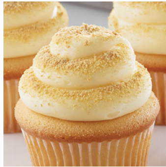
Key Lime Pie