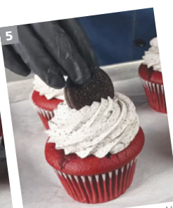
Top with a chocolate cream filled cookie.