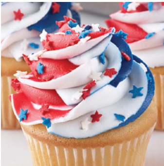
Red, White, & Blue Patriotic