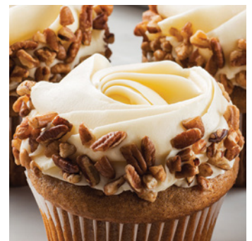
Traditional Carrot Cake