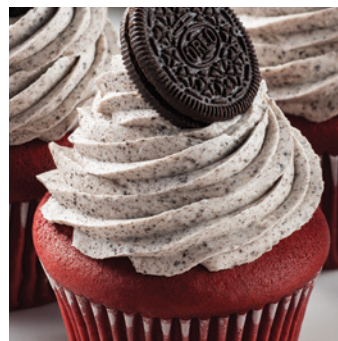
Red Velvet Cookies'n Creme