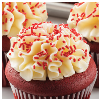
Classic Red Velvet