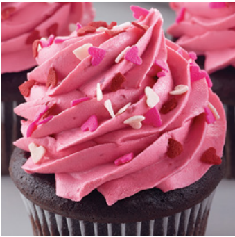
Chocolate Raspberry Valentine's Day