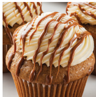
Salted Caramel Carrot Cake