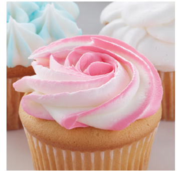
Mother's Day Bouquet