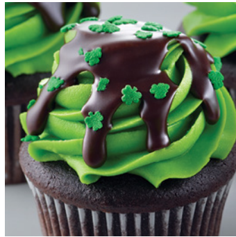
Chocolate Mint St. Patrick's Day