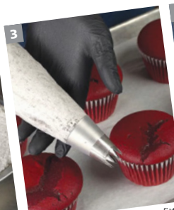
Place the mixture in a piping bag fitted with a large star tip.