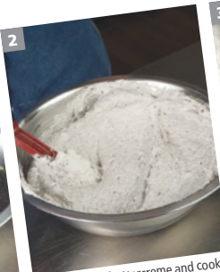
Shown: Mixed buttercream and cookie crumbs