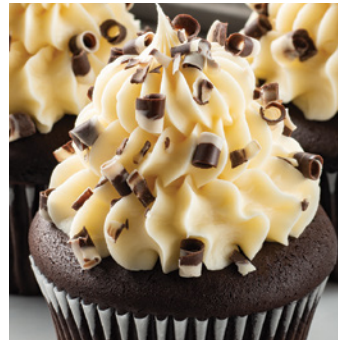
Dark Chocolate Cheesecake